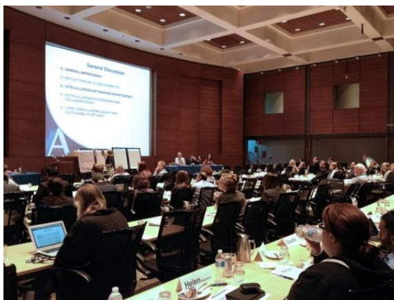
Network Investigators present their research at AllerGen's Scientific Meeting, June 2013.

From 2005 to 2012, AllerGen held Annual Conferences open to the public, which focused on the presentation of research results.